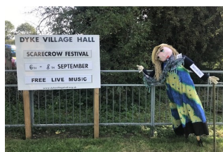
Dances with Crows