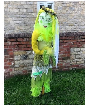
The Lincolnshire Fairy