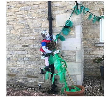
Jack and the Bean Crows

Thank you to all who helped to make the Scarecrow festival so successful! Thank you to the gang of men from the village and surrounding area, who worked tirelessly to fetch, erect and dismantle the marquees, gazebos and other equipment. Thank you to our local farmers, who despite a very delayed harvest and having to work all through the nights, supplied straw for us, helped to move large mar- quees and loaned the use of their large trailers. Thank you to all who helped out on the Wishing Well field, by supporting the stalls, running the games, displaying their custom cars and providing us with excellent shows of singing, music and dance. And thanks to the staff and owners of the Wishing Well Inn for partnering us and hosting this Festival.