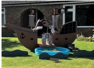
The Jolly Bodger

For a list of the winners: Go to www.dykevillagehall.org.uk/ news and events.