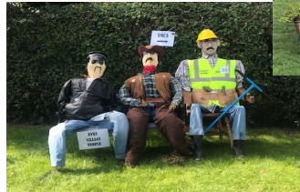
The Dyke Village People