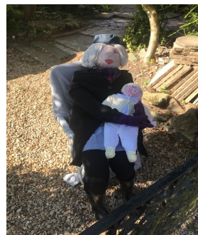
Call the Madwife.