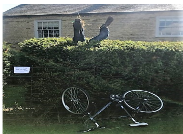
Should have gone to Spec savers