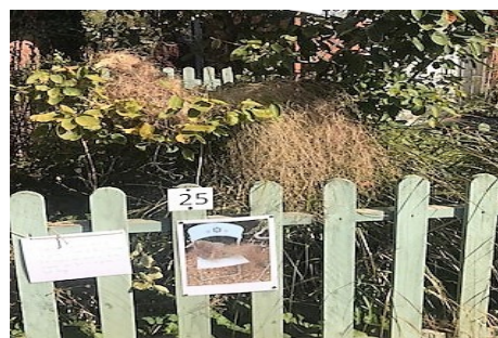
The Brown Booby Bird.: look carefully!