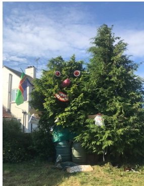
The Jolly Green Giant