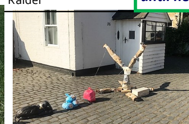
Jelly bean and the Angry Birds