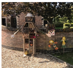
Eco Friendly Fred