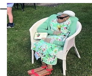
Champagne Spoken here.