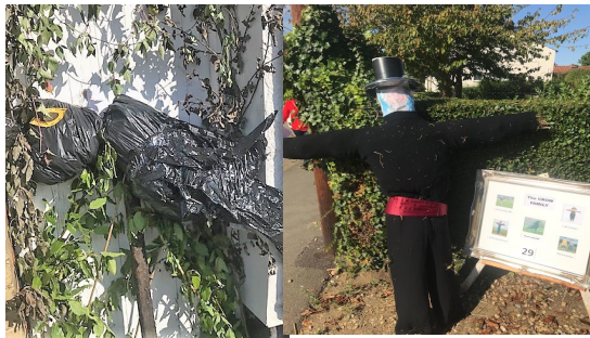
The Crow Family