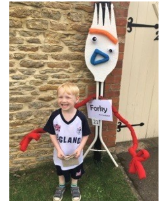
Say hello to Forky, with friend.

Thank you to everyone who baked a cake, made jams and gave fruit and other items, and volunteered some much needed help. A special thanks to our local W.I. who baked most of the cakes, served refreshments and washed up tirelessly in a very busy kitchen.