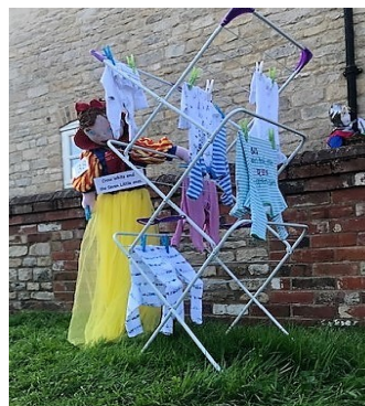
Crow White and the 7 little ones.