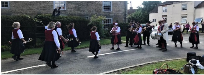
The Cross Key Clog Dancers.