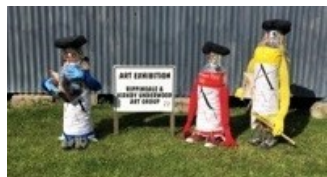
The Paint People