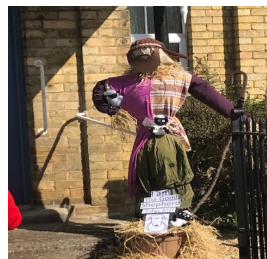
The Good Shepherd.