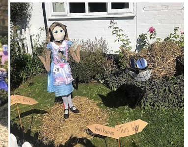
Grinning like a Cheshire Cat.