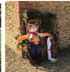
Woody, Toy Story.