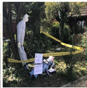
CSI; death by chocolate.