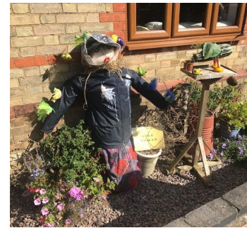
The Bird Woman