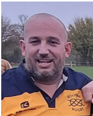
Wishing Well F.C. c.2002